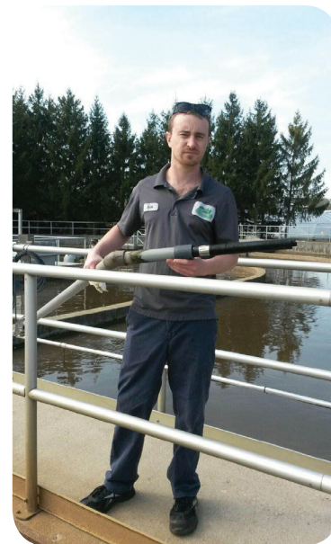
Team member holding an FDO probe (Optical DO)