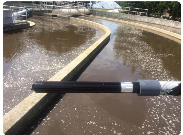
The FDO (optical dissolved oxygen) probe struck by lightning

"It was a pretty good-sized storm...we had a YSI DO probe in the second ring of the oxidation ditch. The lightning probably struck the channel, spread across the water and collected on the probe."